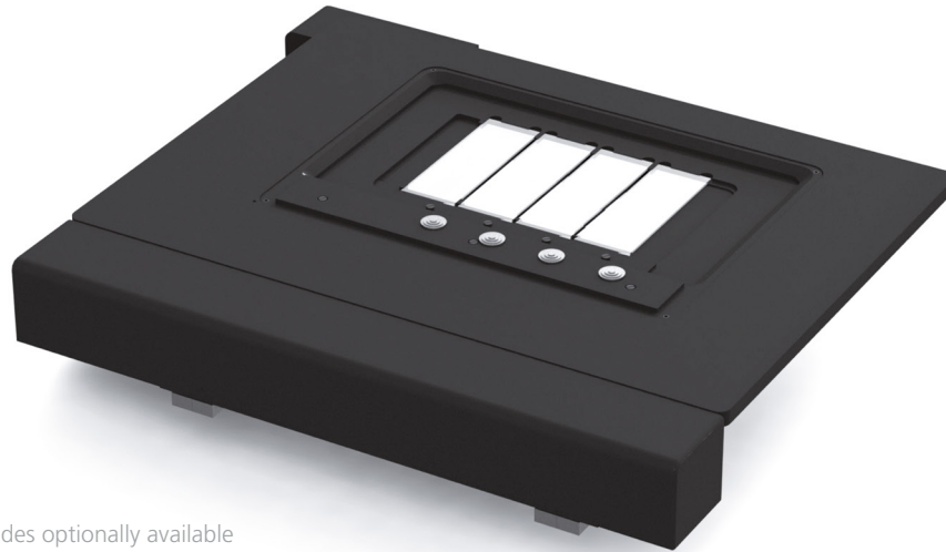
Stage insert for 4 slides optionally available